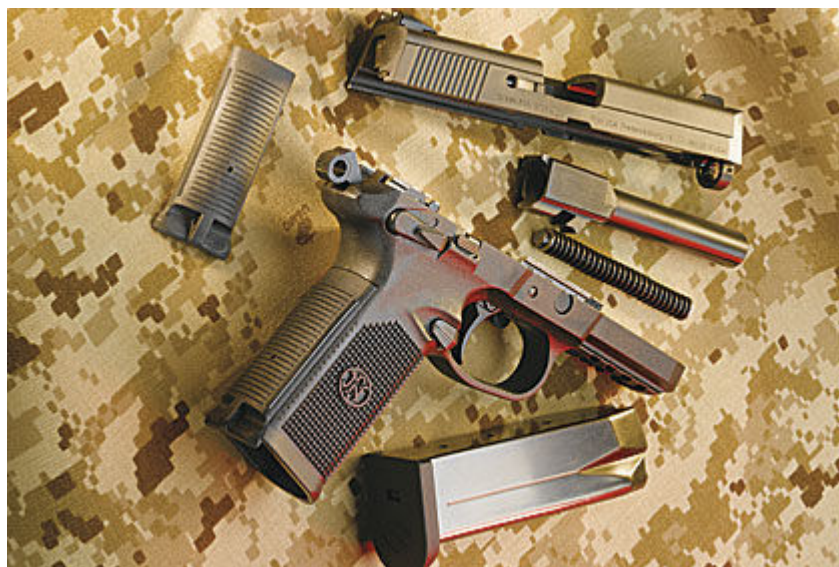
Takedown of the FNP-45 is a snap. Lock the slide back, remove the magazine, pivot the takedown lever, unlock the slide stop, and ease off the slide. You're done!

I thought I'd have more trouble with the trigger reach than test-firing actually uncovered. When I first shot the FNP-45, I was at an industry gathering and couldn't do any real drills or timed shooting. At my home range I could shoot drills and see how the FN felt coming off a table or out of a holster. As for accuracy, you might think this is one of those legendary "gunwriter guns" that has been tuned just for us lucky stiff.