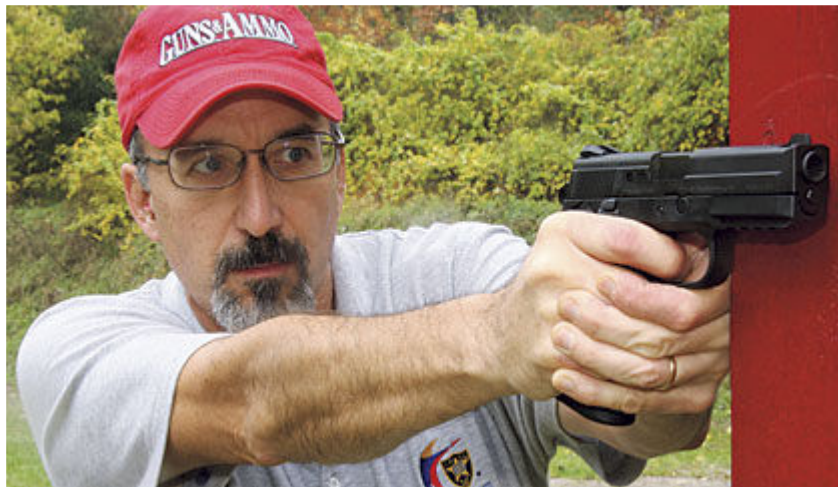
A plus for big pistols: The author found the FNP-45 remarkably soft-shooting and controllable.

The backstrap of the FN is changeable, provided you have a simple tool. A 3/16- or 5/32-inch punch is all you need. In a pinch, in a dusty little village in Iraq, you could probably manage with a paperclip or M16 firing pin. Push the pin into the hole in the back of the backstrap to depress the locking latch. Then slide the old backstrap down and off. Slide the new one up until it locks into place, and you're done.