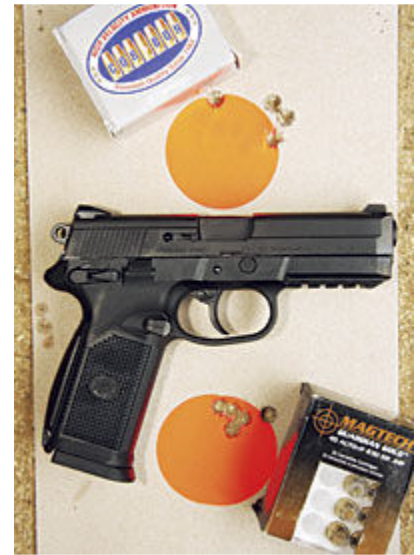
Using Magtech Guardian Gold and Cor-Bon 230-grain JHPs, accuracy results at 25 yards were well beyond "combat spec."

The beefier frame and slide put the bore axis a bit higher over your hand, a difference likely to be noticed only by competition shooters. If you compare the FNP-45 to a 1911 (I hate to keep coming back to the old standby, but we need something most of us have all shot for comparison), the FNP-45 front sight is going to rise higher in recoil. But it won't do anything more than that, and the very effective texturing on the gripping area of the frame will keep the gun from squirming on you. As I've mentioned before, muzzle rise is not a problem. The front sight pops up when you shoot; it drops back down and you're back on target.