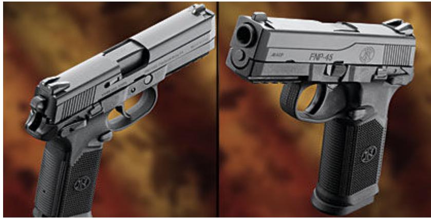
Desirable features on the FNP-45 include three-dot combat sights (left) and an ambidextrous slide stop (right).

We should thank the U.S. Army for being indecisive on sidearms. If not for its on-again, off-again approach to picking a new pistol, we wouldn't have the choices we now have. FNH-USA has been unveiling 9mm and .40 S&W pistols for defense and law enforcement for the last few years, getting designs out to replace the classic Hi Power. Had the Army simply said "We need new handguns" and gone through an undelayed test and selection process on the first go-around, FN would not have had the time to produce the FNP-45, a big blaster of a .45 whose slide is a big chunk of stainless steel and whose frame is molded polymer. The front and rear sights are pressed into dovetails, and the extractor is an external one, using a spring-and-plunger-powered system. It also has a lump on it for use as a loaded-chamber indicator.